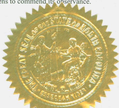
BEVERLY EAVES PERDUE

NOW, THEREFORE, I, BEVERLY EAVES PERDUE, Governor of the State of North Carolina, do hereby proclaim September 20-26, 2010, as "FALLS PREVENTION AWARENESS WEEK" in North Carolina and urge our citizens to commend its observance.