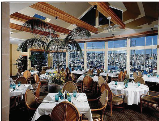
View of the marina from Humphrey's Dining Room

Every aspect of the NFTC Annual Conference offers opportunities to connect with other professionals so that you will gain support, and develop connections. The Friday evening cocktail party will give you the chance to meet and greet faculty, other participants and leave with a sense of fellowship and mission unlike other professional meetings