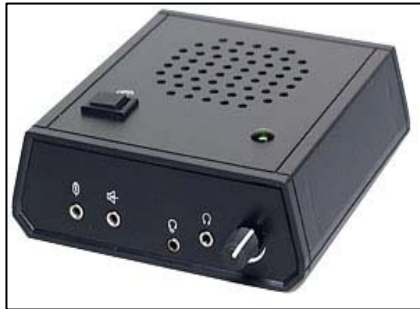
PHONEIT control #800097