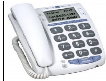
GE speakerphone #50127