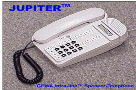
GEWA Phone #5011301