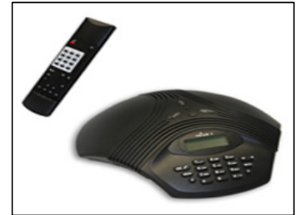
PRISM PHONE #501470