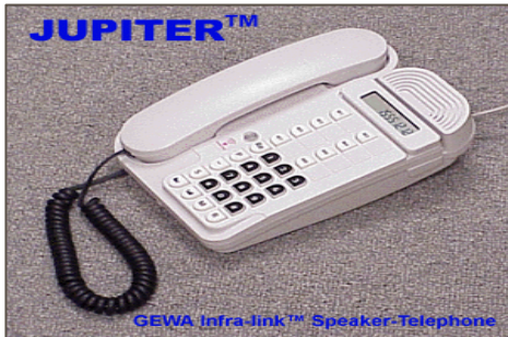
GEWA Phone #5011301