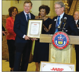
State of Colorado