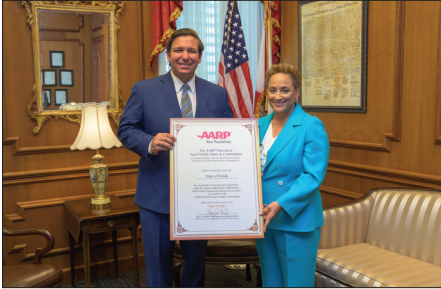
State of Florida