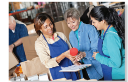
Work or volunteer