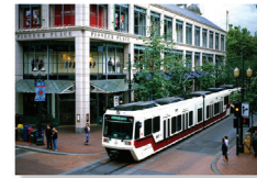
Get around without a car