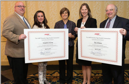
Ithaca and Tompkins County, New York