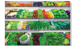
Buy healthy food