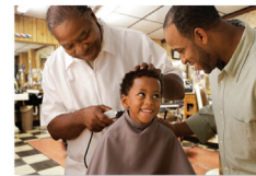
Find the services they need