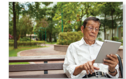
Spend time outdoors