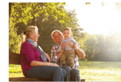
... and make their city, town or neighborhood a lifelong home.