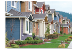
Live safely and comfortably