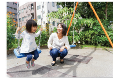
Enjoy public places