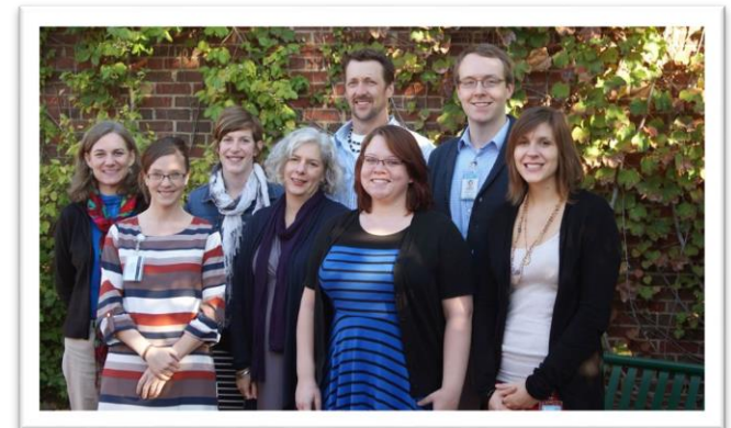
KBR funded team – UNC SSW & CECMH