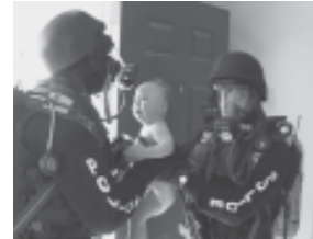
Is your county ready to respond to meth labs?