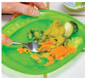
Mashed soft-cooked vegetables, like sweet potatoes

By about 7 or 8 months, your baby may be ready to try mashed foods in addition to what he is already eating. Use the back of a fork to mash foods well. Here are some foods he may like to try: