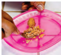
Small pieces of cooked meat, like ground beef