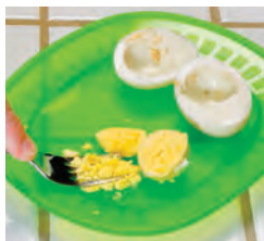
Chopped cooked egg yolk (no egg whites)