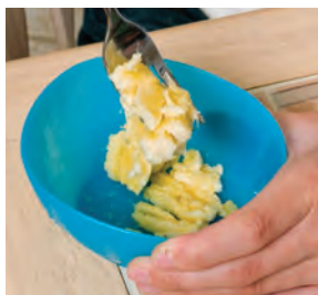
Mashed soft fruits, like bananas