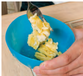
Mashed soft fruits, like bananas