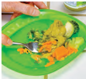
Mashed soft-cooked vegetables, like sweet potatoes

By about 7 or 8 months, your baby may be ready to try mashed foods in addition to what he is already eating. Use the back of a fork to mash foods well. Here are some foods he may like to try: