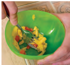
Mashed soft-cooked noodles or rice