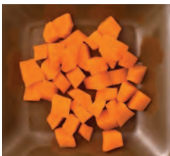
Chopped soft-cooked vegetables, like carrots

Your baby is already eating pureed and mashed foods. She may also be ready for chopped soft foods. Just be sure to cut up everything into small pieces. Here are examples of foods she may like to try: