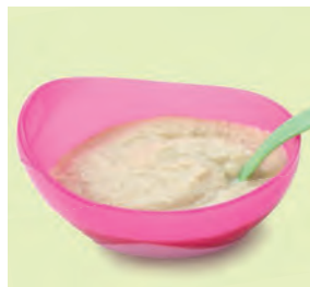
Rice, oat, or barley cereal