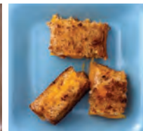
Small pieces of grilled cheese sandwich