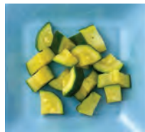
Small pieces of soft-cooked vegetables, like zucchini