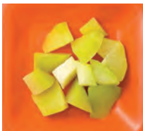
Small pieces of soft peeled fruits, like melon

In addition to everything your baby is already eating, he may be ready for small pieces of your family's foods. Start with soft foods at first, and then move on to firmer textures when he's ready. Some foods he may like: