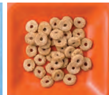
Finger foods like dry cereal or crackers