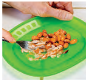
Mashed soft-cooked beans