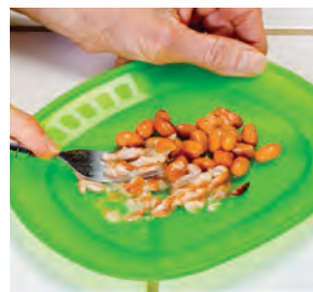
Mashed soft-cooked beans