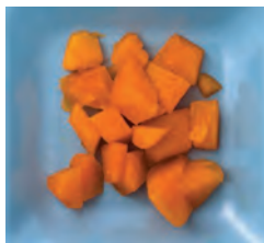
Chopped soft peeled fruits, like ripe papaya