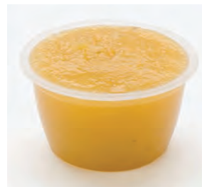
Pureed fruits, like unsweetened applesauce