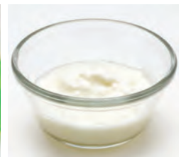
Plain yogurt mixed with fruit