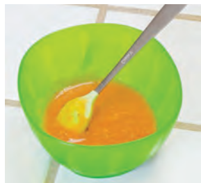
Pureed vegetables, like carrots

At around 6 months, your baby may be ready to eat smooth food that has been strained or pureed. Here are some examples: