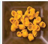
Small bites of pasta or noodle dishes