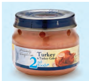
Well-pureed meat, like turkey