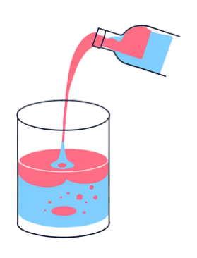
Liquid based formulas are more susceptible to alterations in quality