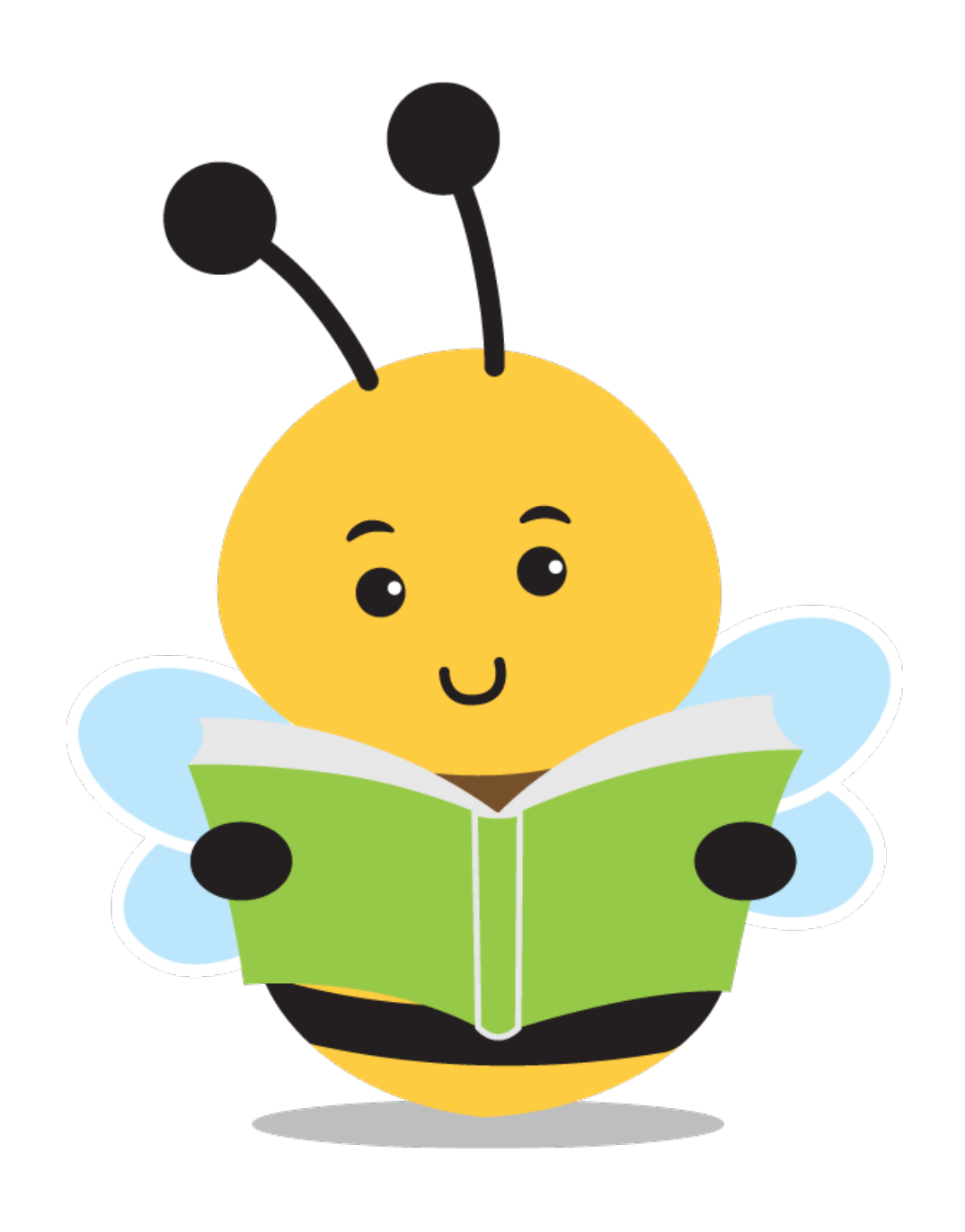
North Carolina Infant-Toddler Program Notice of Child & Family Rights